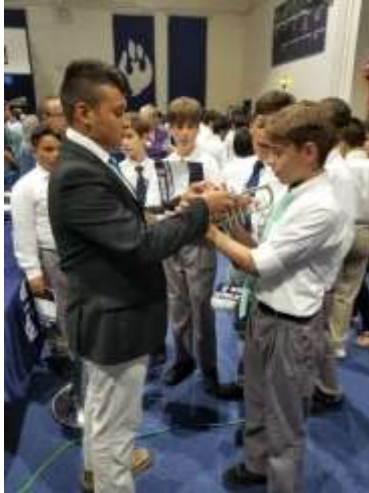
8 th Grade Visits Central Catholic High School

tops in plastic zipper bags or envelopes labeled with name & grade. Individual box tops do not have to be labeled.